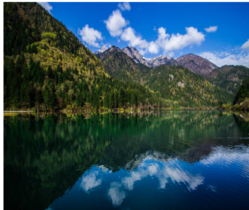
Jiuzhaigou stunning View

Jiuzhaigou, translated Nine Stockade Valley, is one of the top China destinations, especially in the super peak months of October. We also visit the equally popular Huanglong. We enter from the north, traveling along good roads that passes beautiful Tibetan villages and rolling hills. We overnight in Tibetan town/village of Xiahe, Langmusi and Ruergai. We spend a full day in Jiuzhaigou when gates open till gate closes, using the inner walking trails, away from the expected huge crowds. We "tapau" our lunch and spend as much time as possible, seeing as much as possible.